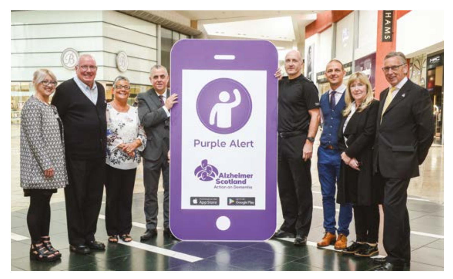
Launching our Purple Alert app in September 2017

At Alzheimer Scotland, we're also committed to exploring innovative ideas and approaches, to make sure that people with dementia and their carers are supported in ways that work best for them as individuals, couples and families.