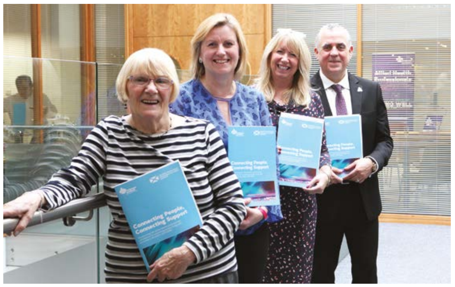
Launching 'Connecting People, Connecting Support' in September 2017

"Connecting People, Connecting Support' is not only the first policy of its kind for Scotland, it presents all AHPs, regardless of profession or service setting, with a great opportunity to realise their full skill-sets and work in new ways to deliver support and enablement for people with dementia."